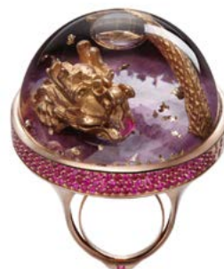
LIVELY & LOVELY DRAGON

The most precious love is tinged with the passionate red of the rubies, the refractions of the white diamonds and the brightness of the rose gold hearts. On top of this romantic scenery, a rose gold ladybird lightly lands.