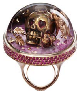
FUSION & FASHION SKULL

The myth of the dragon, auspicious symbol, relives in a fantasy of rose gold, white diamonds and flaming rubies. A story to precious preserve.