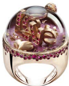
LIVELY & LOVELY LOVE